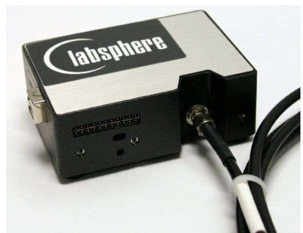
CDS 600 CCD ARRAY SPECTROMETER

The CDS spectrometers easily connect to a PC via an USB-2 port and use a fiber optic cable to connect to the optical head, enabling the remote positioning of the spectrometer. The Windows® XP-based software guides the user through testing procedures making complex spectral measurements simple while still meeting the needs of experienced researchers.