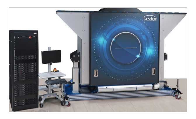
Spectral Radiance at Full Power