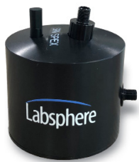
RSA-FO-150 Fiber Optic Single Beam Reflectance Spectroscopy Accessory