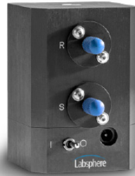
RSA-REF-50-DB Dual Beam Reflectance Spectroscopy Accessory